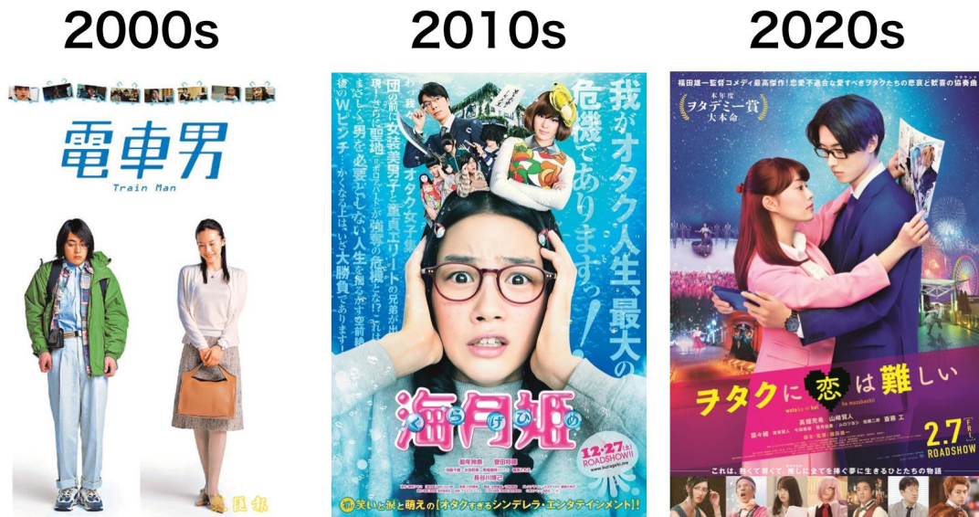
Figure 1. Movies about Otaku

From this research, I thought that the number of otaku has increased now. Otaku have something to recommend. Therefore, when I asked “Do you have a favorite person, character or thing?”, I found that 86 percent of the respondents answered “Yes”. I found that many people are otaku. It can be seen that otaku have become familiar to people today. Our feelings for otaku have changed.