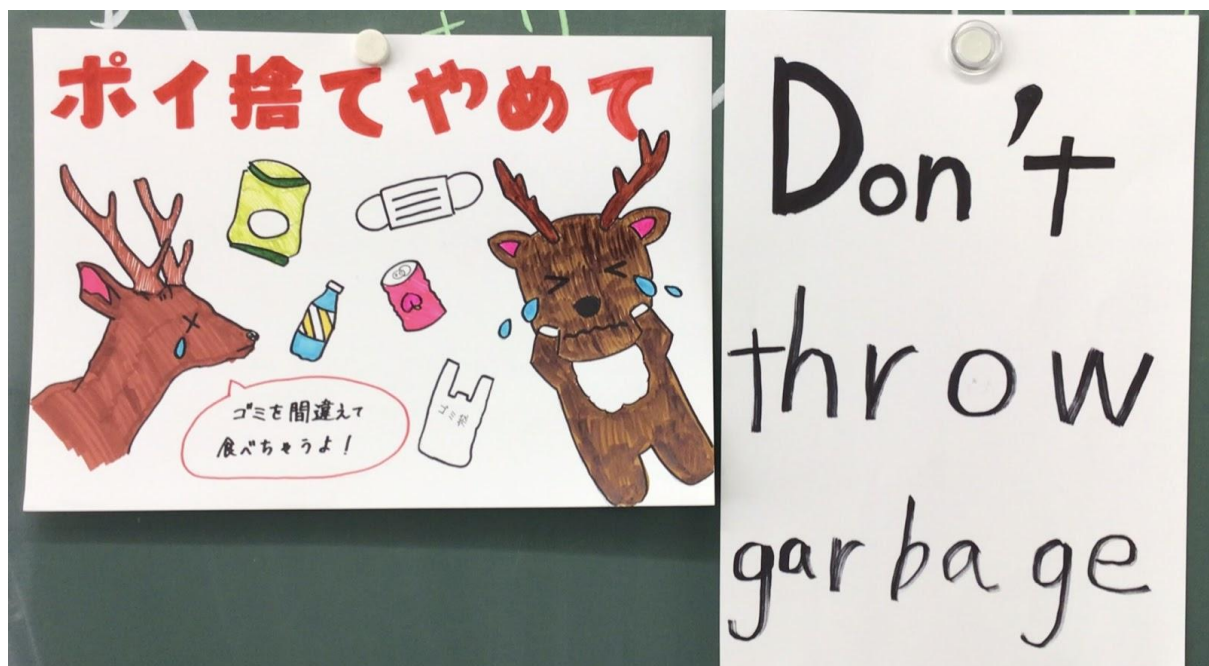
Figure 3. Image showing the posters displayed at Nara Kokusai High School

A poster was created and displayed at Nara Kokusai High School to raise awareness for the damage to deers in Nara Park. This is because we thought that changing people's consciousness would connect to the solution of this problem. First, we thought about what kind of posters would attract people's attention. Therefore, we created a poster focused on pictures and a poster focused on letters, put them up in front of the entrance of the school, and did a questionnaire about which poster was easier to see after one week.