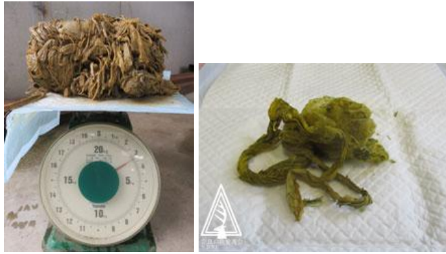
Figure 1. Images showing plastic found in deer by Nara Deer Welfare Association Blog Event Information and Daily Things (July 2021)